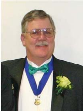
1884: Bob Flaherty, father of documentary film is born on February 16 th , Happy Birthday Bob!